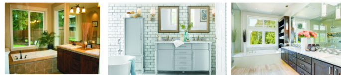
Real Estate page compiled by Charles Devasagayam