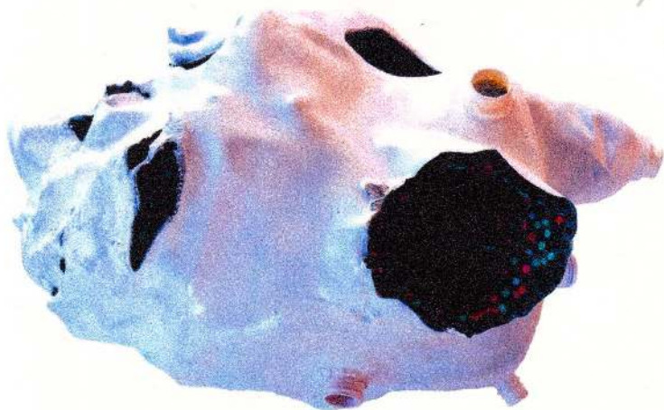
Stress, 2018, mixed media, 71cm x 48.5cm