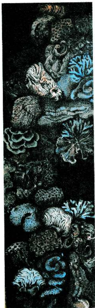
Self Portrait I, 2018, Acrylic on Canvas, 150cm x 45cm