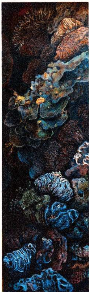
Self Portrait III, 2018, Acrylic on Canvas, 150cm x 45cm