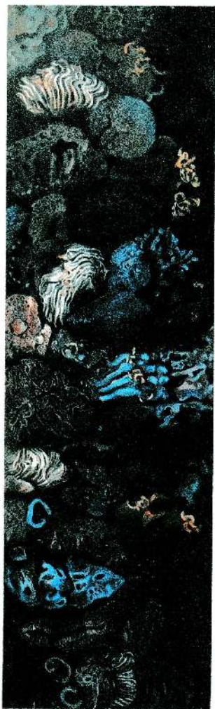
Self Portrait II, 2018, Acrylic on Canvas, 150cm x 45cm