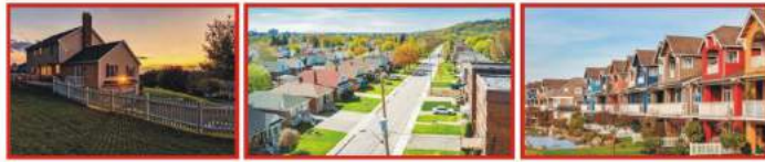
Real Estate page compiled by Charles Devasagayam