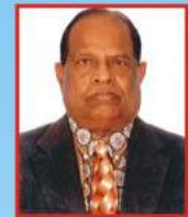
By. Thambu Kanagasabai - LLM (London) Former Lecturer in Law, University of Colombo.

Foreign Minister G.L. Pieris's speech at the 49th Session of UN Human Rights Council in Geneva is impeccably laced with web of lies and littered with hollow and empty promises and empty undertakings having been cleverly woven to cover up the truths and mislead the United Nations, UNHRC and International Community. Undoubtedly there will be few buyers of his labored delivery as the UNHRC, United Nations and International Community are fully aware of the facts and have fully experienced the cavalier treatment of Human Rights, Accountability and justice by the Sri Lankan Government particularly since 2006 during the war with Liberation Tigers of Tamil Eelam and after the war inclusive of the Human Rights Resolutions passed since 2012.