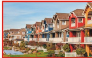
Real Estate page compiled by Charles Devasagayam