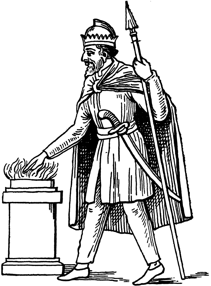
KANISHKA KING OF THE KUSHANS (A. D. 78—106) (from his coins)