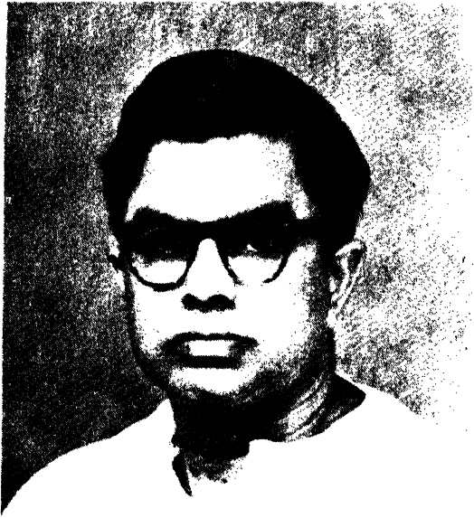
Sri C. SUBRAMANIAM, Minister for Finance & Education, Government of Madras.