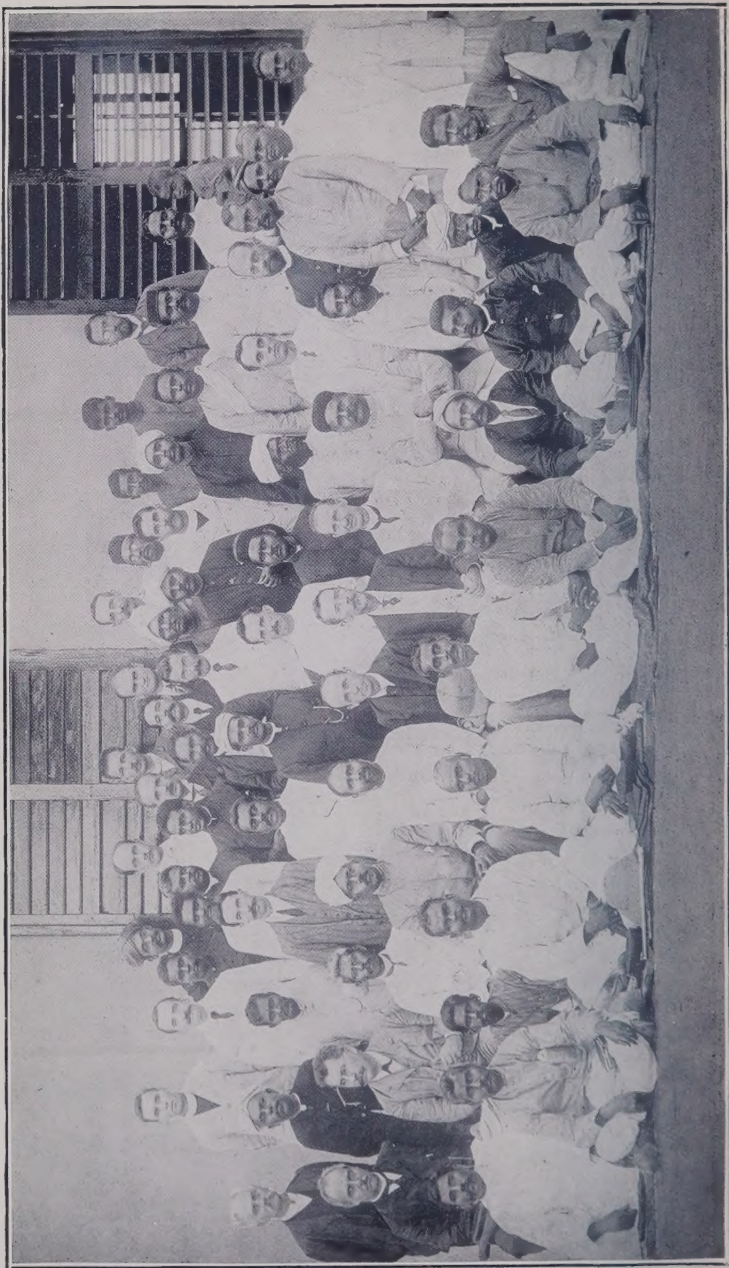
Members of the Fourth General Assembly.