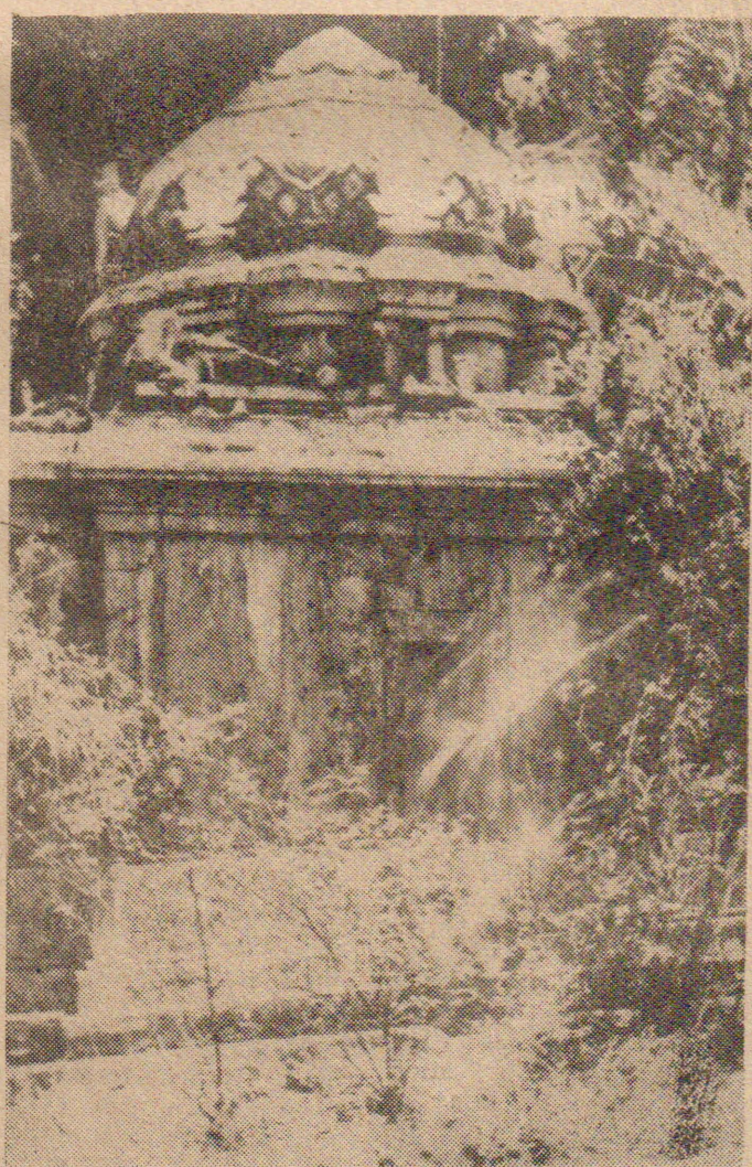
Sri Kathiresan Temple, Mawanella, allegedly attacked on the 19th August 1977, (See Page 3 for report)

"Those who do not remember the past are condemned to relive it"