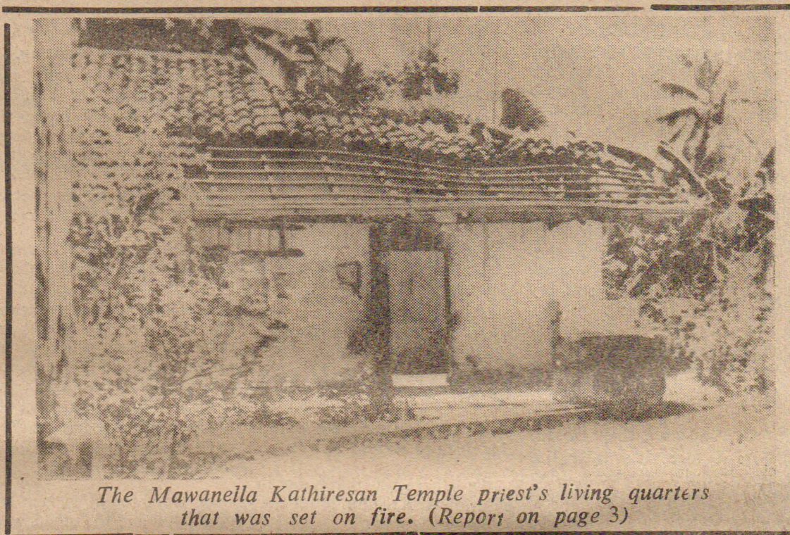
The Mawanella Kathiresan Temple priest's living quarters that was set on fire. (Report on page 3)

Q: How was the damage to the goods caused? A: The damage was caused by fire.