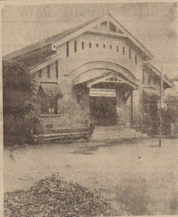
The Power Station, Jaffna