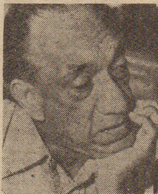
'His first major crisis'

"Thousands of Tamil tea-plantation workers-descendan-