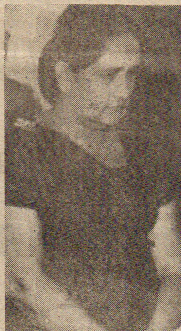
Defeated Prime Minister Mrs. Sirima Bandaranaike

"The Sinhalese respond by claiming that the measures are only restoring a balance between the two communities that was upset by the British colonial rulers. It is true that British rule favoured the education and promotion of the minority Tamils but the modern resurgence of Sinhalese nationalism is also a response to the age-old fear of being swamped by the 50 million Tamils living in south India—a mere 22 miles from Sri Lanka across the Palk Strait. Fears of cultural annihilation on both sides have now dangerously polarized the two peoples. Jayewardene made a clean sweep of Sinhalese votes in the recent elections, but all the