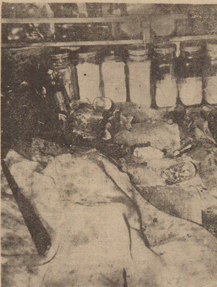
Photograph of a partly wrecked shop in Jaffna town, alleged to have been smashed up by Police personnel