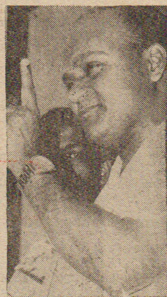
'Peaceful solution..... but no bondage'

"BONDAGE: But such pronouncements could not hide the deep-seated grievances that had sparked the violence in the first place. "We are for a peaceful solution," said Appapillai Amir thalingam, the leader of the separatist Tamil United liberation Front (TULF). "But