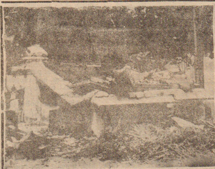
Matara Murugan Temple destruction — another view

Q: The reputation of the medical staff of the Jaffna hospital was at stake because of that rumour? A: Yes.