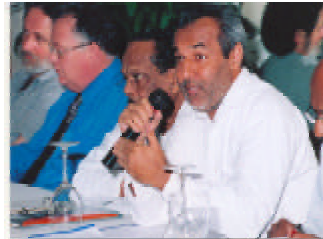
Hon Rauf Hakeem