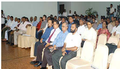
Attendees at the Launch

Present at the historic occasion were representatives from the Federation of Media Employees Trade Unions, Sri Lanka Working Journalists Association, Sri Lanka Tamil Media Alliance, Sri Lanka Muslim Media Forum and Free Media Movement. All these organisations had co-operated in the design of the Charter