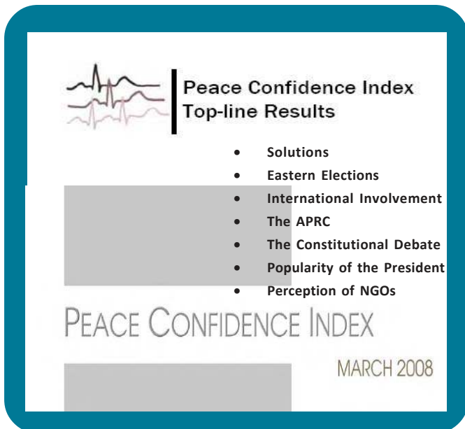
“Sinhala Support for the Governments Military Campaign Strong: PCI,” Daily Mirror 30th March

Released in March 2008 this is the 28 th Wave of this Public Opinion Survey, offering data for a comparative study on changing public opinion on key issues, ranging from perceptions on war and peace to current political developments.