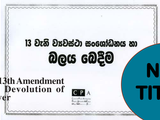
the 13th Amendment and Devolution of Power