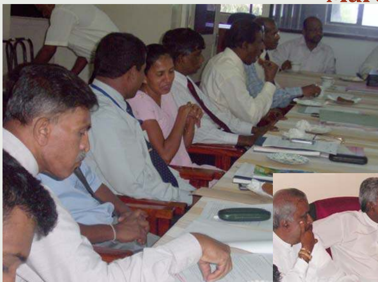
Southern Provincial Council Representatives and Officials