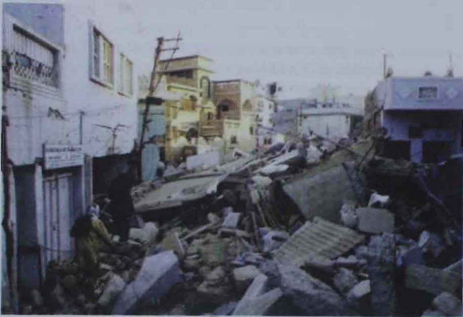
Figure 2. Damage to Bhuj, 2001.

I had also conducted doctoral fieldwork in Kachchh before the earthquake and made a number of close friends in Bhuj, the district capital. I returned to Kachchh in 2002, and since that time have spent a further fourteen months with them and with other people researching various aspects of the post-earthquake reconstruction. This time has been as challenging as it has been interesting. Thousands of people still carry the physical and mental scars left by the disaster, although, often, I feel these healing wounds are only indirectly visible – seen for example in the tenacious pursuit of hobbies, routines and other activities such as political protest. The air is often heavily laden with pessimism, and sometimes hypocrisy.