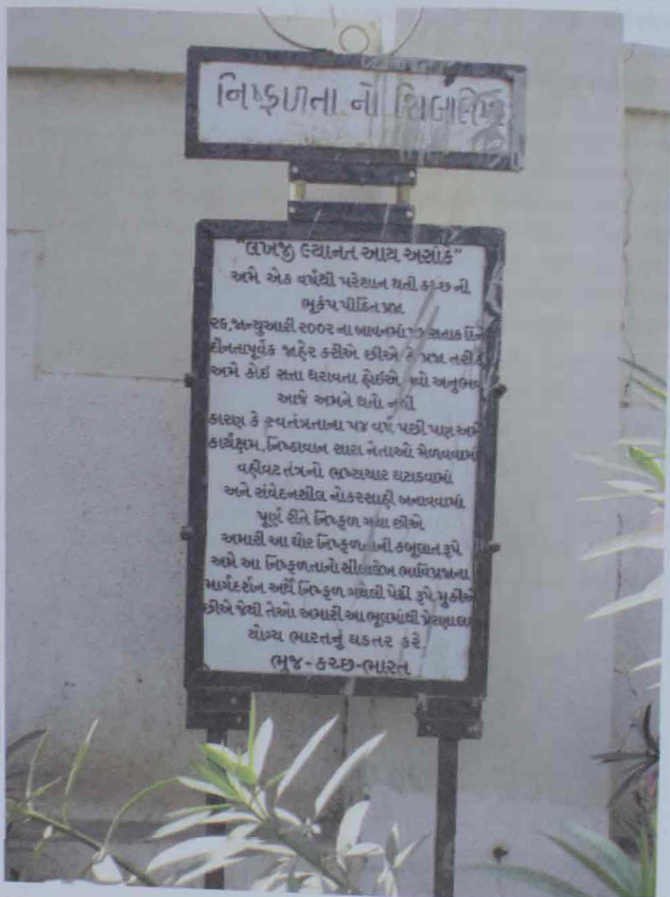
Figure 4. The Inscription of Failure.

negligence'. This action sowed the seeds of malcontent, and popular protests came to dominate all future anniversaries of the disaster. On the first anniversary, a group of elite citizens raised an unusual inscription, an inscription of failure, which read: