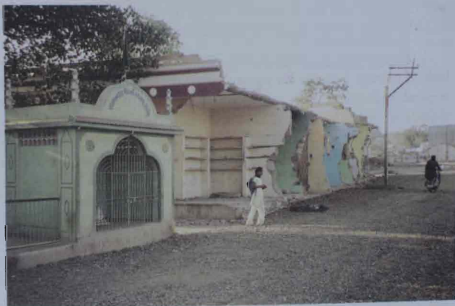
Figure 3. An example of the 'cutting' of undamaged property to make way for a new road.

The public consultation exercise proved to be very successful, but not perhaps in the way intended, and gave space for people to articulate their private interests in the sentimental language of collective nostalgia. Large numbers of people found good reason why their homes should not be destroyed and used the language of heritage and 'shared identity' fostered by planners and development banks to explain their case. It appeared to many as if the Government were taking away property to make way for new roads and 'modern development' without compensation; this caused widespread anxiety and resulted in a number of suicides. To an extent, the utter tragedy of these suicides stood as a metaphor for the popular perceptions of maladministration and alienation. Gangs of private contractors, mostly from distant parts of northern India, descended on the town at night with monstrous machinery and hoards of (supposedly) wild and unruly labourers from Madhya Pradesh to demolish what remained of the old town and make way for new roads. These processes became known as 'cutting' (see Figure 3)