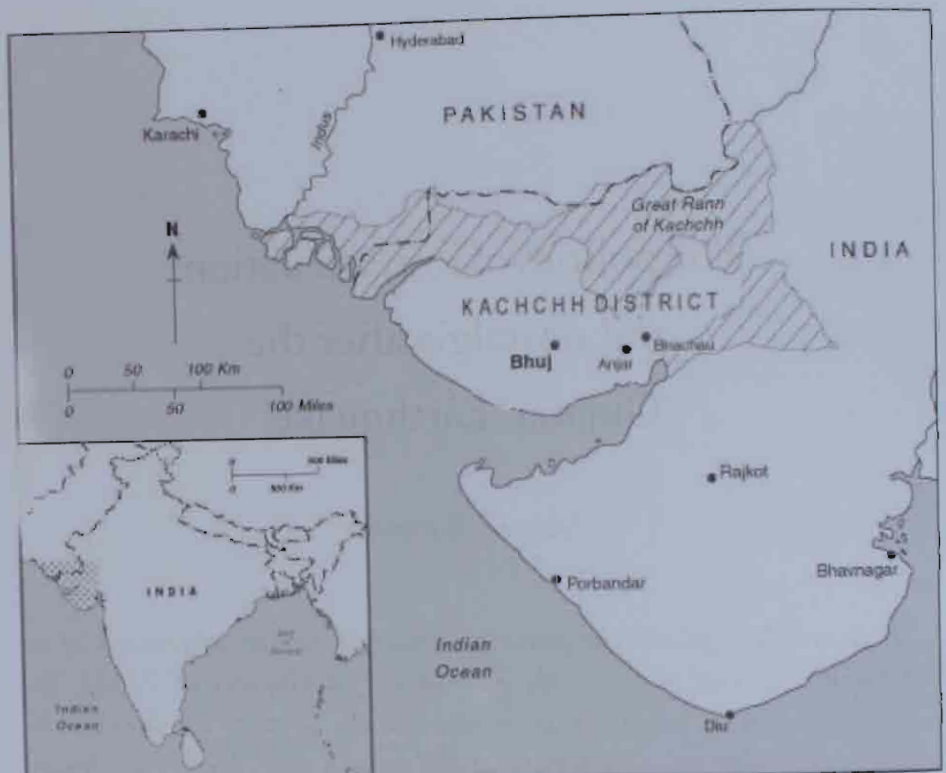
Figure 1. Map Showing Kachchh District

implementation of the Indian Constitution. Throughout the country, ceremonies were taking place and children were parading through the streets waving the national flag. In Kachchh District, in the far west of Gujarat (see Figure 1),