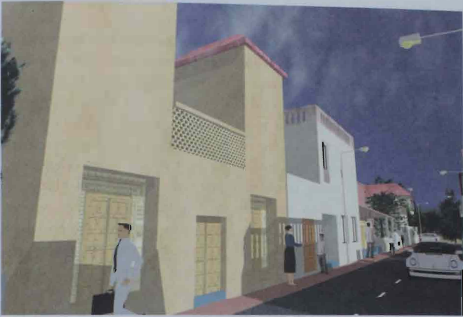
Figure 6. The Impression of an Architect of Bhuj's New Suburbs used on Government-Sponsored Information Pamphlets, 2003.