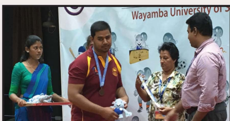
M.R.M.Al. Ameer Bronze Medal