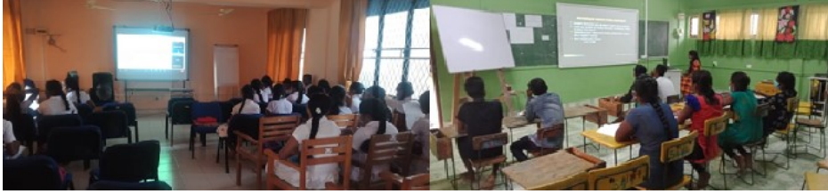
Our core activities

e-Kalvi charity fund Inc. is a registered charity organization founded by Jaffna University Graduates Association-Victoria (JUGA-VIC), Australia, comprising 19 management committee members for the current year (2020/2021). e-Kalvi charity conducts e-learning activities in underprivileged areas of the Northern, Eastern, and Upcountry regions of Sri Lanka to address a chronic shortage of qualified teachers. In 2016, the first e-Kalvi centre was inaugurated in Thuraineelavanai, Batticaloa, with the financial assistance of St. Anthony's Group via the Lions Club of Colombo Grant Circle (LCCGC). Since then, the number of e-Kalvi centres has gradually grown to nearly 50. We initially offered face-to-face teaching with offline e-lessons and then steadily moved to offline and online teaching methods. Each centre is managed by an administrative committee comprising parents, teachers, and well-wishers from that community and closely monitored by the e-Kalvi management committee. All e-Kalvi centres are funded and running successfully with the help of well-wishers from local and diaspora communities. To each centre, we provide multimedia equipment, including computers, tablets, multimedia projectors, a projector screen, and a multifunction laser photocopier.