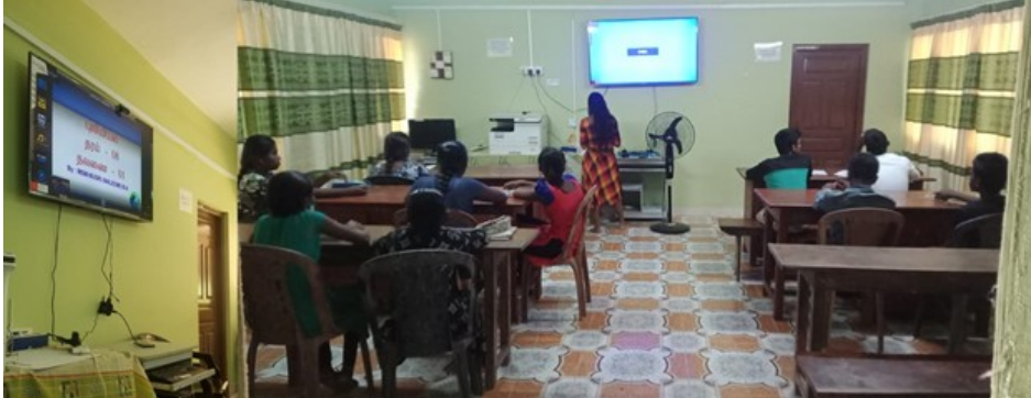
e-Kalvi smart classroom

Every classroom is set to be transformed into a smart classroom as the curriculum in Sri Lanka changes and digital education becomes more critical in the current world. Therefore, we have already established 20 e-Kalvi smart classrooms and aim to build another 25 smart classrooms across Sri Lanka in the next few months. Part of the funding for this has already been received. Our vision for 2021 is to increase the number of e-Kalvi smart classrooms to 100 if more funding were available. The budget for this project in Sri Lankan rupees is as follows. Please get in touch with us if you can financially support this project.