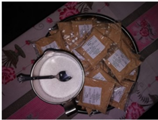
Nava Posha nutritious food by the Sivan Arul Foundation

We have initiated a nutritional project with the collaboration of the Sivan Arul Foundation to provide Nava Posha nutrition to deprived students in our e-Kalvi centres. Nava Posha nutrition contains nine grains, approved by the Medical Research Institute (MRI) of Sri Lanka. It is noteworthy that the funds from the sales of the Nava Posha, produced by the Sivan Arul Foundation, are also being spent on their core activities. Our heartfelt thanks to the Sivan Arul Foundation. A single meal per student costs Rs. 20.00. Please contact us should you wish to support this project.