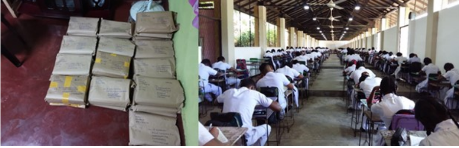
2020 (O/L) model exams by us

We conducted practice examinations for mathematics and science subjects for the 2020 (O/L) batch. These examinations were held at many other schools besides our e-Kalvi centres. The FTGM completed the massive task of printing examination papers and couriering them to all centres and schools involved. We sincerely thank the FTGM for their support.