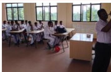
Conducting AAT classes for LVI commerce students