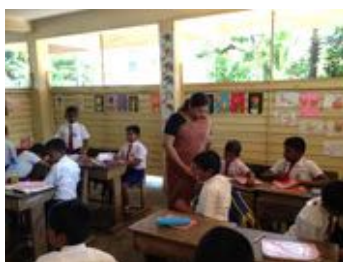
Trilingual studies Gr.4D Classroom activity