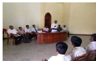
Discussion with the LVI Commerce students regarding AAT course