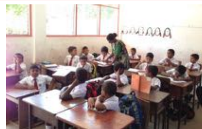
Trilingual studies Gr.3C Classroom activity