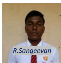
Best Hockey Player