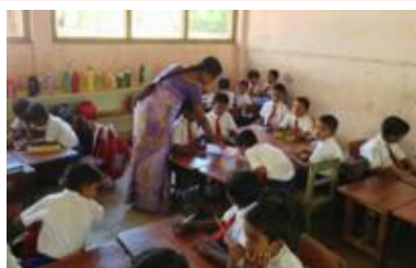
Trilingual studies Gr.1C Classroom activity.