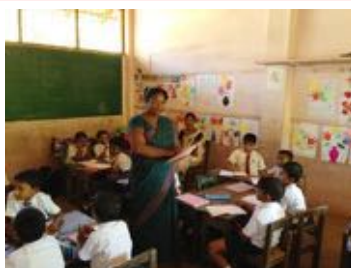
Trilingual studies Gr.2C Classroom activity