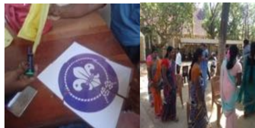
Fixing the World Scout Musical Chairs - Parents' Activity Emblem- Competition

Students involve in physical exercise in the mornings at school.