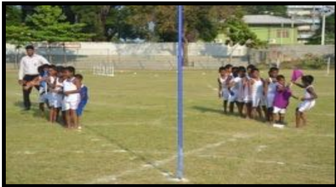
Grade 1 students are welcomed by Gr 2 students.

Our Annual Sports meet was held on 11 th February.