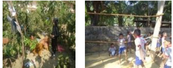
Pack Corner Walking on the Rope- Competition

Our students and parents actively participated in our Scouts Centenary Celebration which was held from 4 th February to 7 th February 2016.