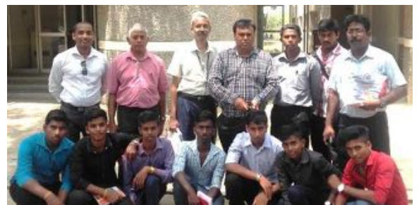
Technology Stream Educational Tour to India