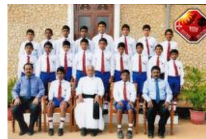
Junior Secondary Monitors - 2016

Ten of our students participated in the 9th National Scout Jamboree of Sri Lanka held in Jaffna from February 20 th to 26 th . They were awarded with Activity badges and Certificates.