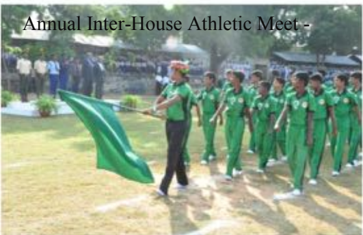
Annual Inter-House Athletic Meet -