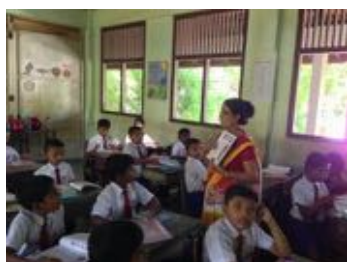
Trilingual studies Gr.4C Classroom activity