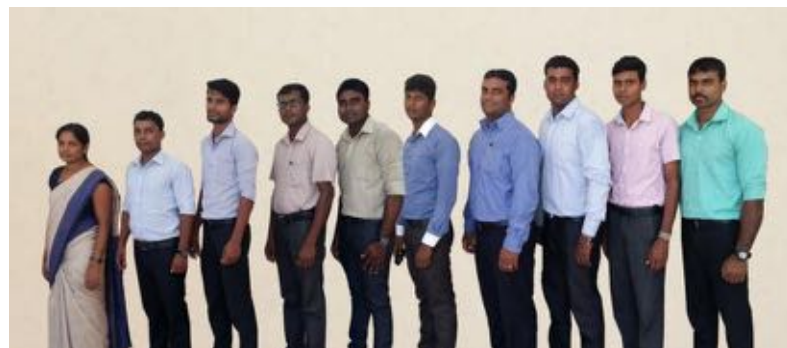
A section of the staff who successfully completed the OUSL Advanced certificate in English for Business and Professional Communication– Stage 01. Total number completed - 19