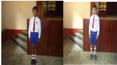
Head Prefect Deputy Head Prefect