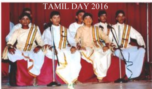
Grade ten students staged a programme called "Kanamum Kadchiyum" It was well appreciated by the audience.