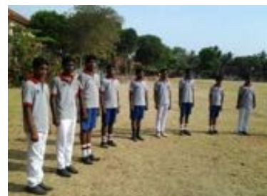
Students from our section participated in the Scout Centenary Celebrations from 4 th to 7 th April 2016