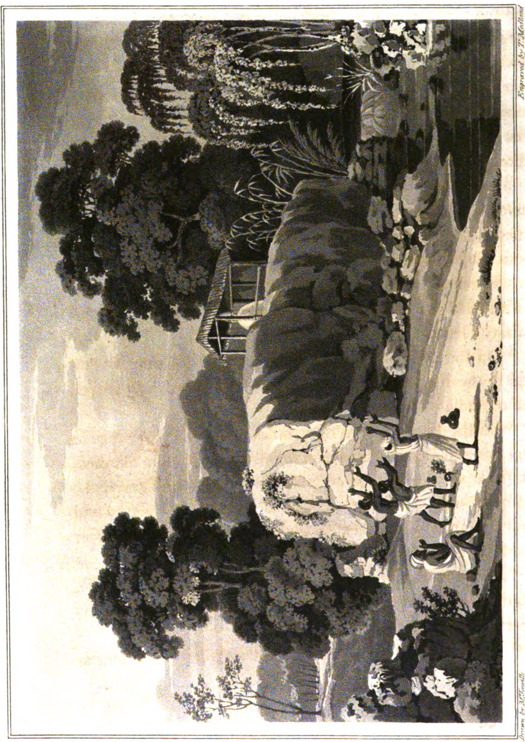
Temple of Buddha at Arandera near Palmyra in Ceylon

Published by Agnew & Sons, 49, Abchurch Lane, London, E.C. 4